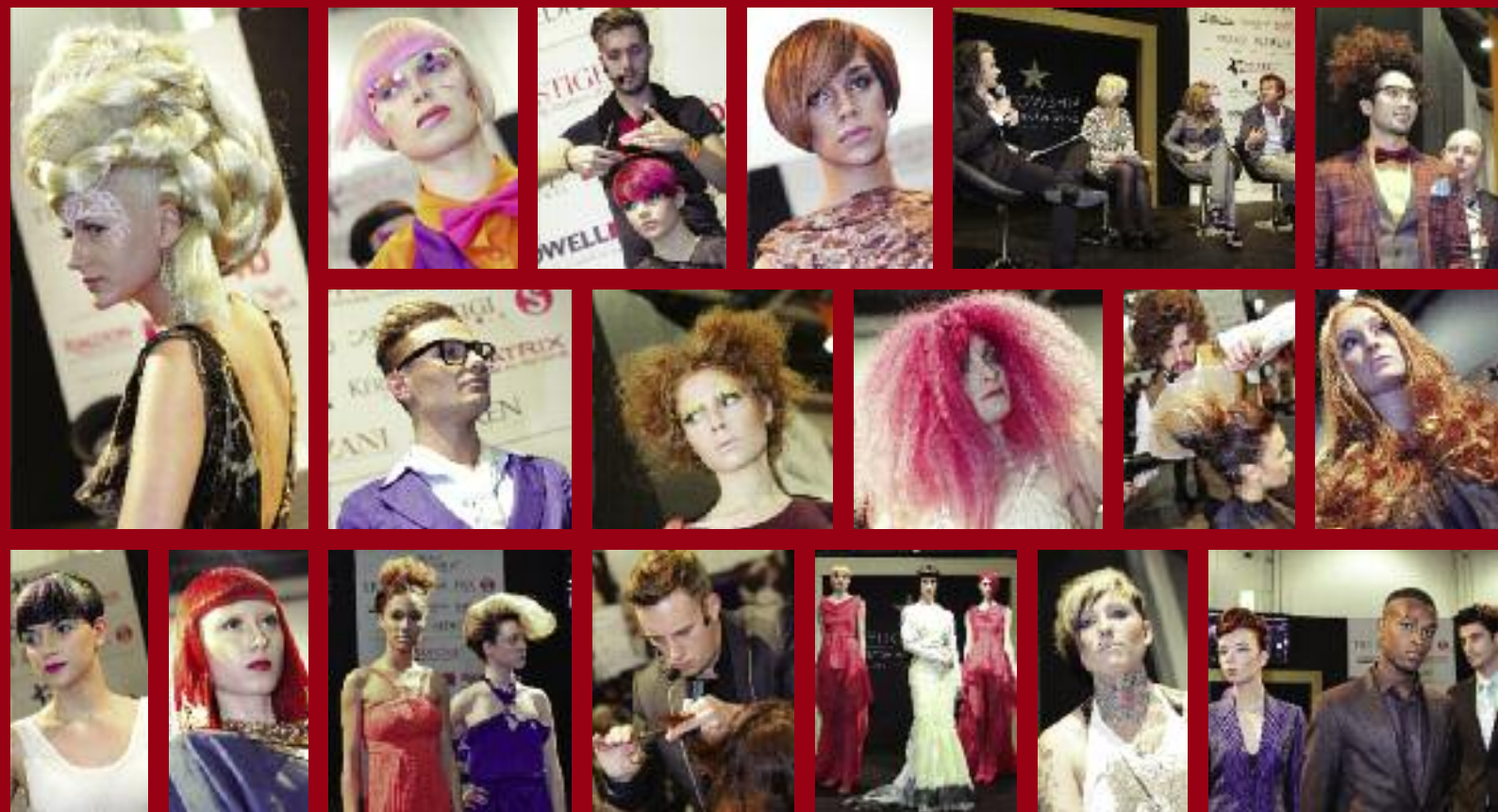
(Left to Right) Affinage, Sassoon, Fellowship – Ciente, L'Oréal, City & Guilds, ClubStar Competition, ClubStar 2010 Art Team, F.A.M.E. Team 2012, ClubStar 2011 Art Team, Wella, Fellowship – The Hair Advice Centre, Fellowship – Philosophy, F.A.M.E. Team 2012, Fellowship – Karine Jackson Junior Art Team, TIGI, Fellowship – Sanrizz, TIGI, Fellowship Alan d