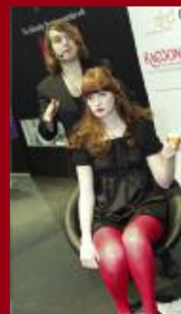
(Left to Right) F.A.M.E. Team 2011, Fellowship – JET Hairdressing and Alan d Hairdressing Academy, L'Oréal

If you were looking for inspiration for the next 12 months and beyond, there was no better place to be than at the Fellowship for British Hairdressing stage at Salon 2011. Held over three days, the platform presented a hybrid of creativity.