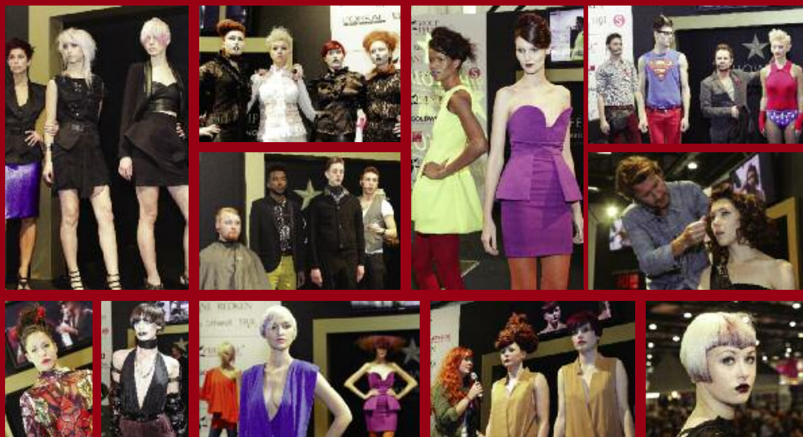
(Left to Right) Toni & Guy, Fellowship – Mahogany and The Gallery, Fellowship Men's, Goldwell, L'Oréal, ghd Artistic Team, Fellowship Shooting Stars, F.A.M.E. Team 2011, Goldwell, Fellowship – Project X, Wella